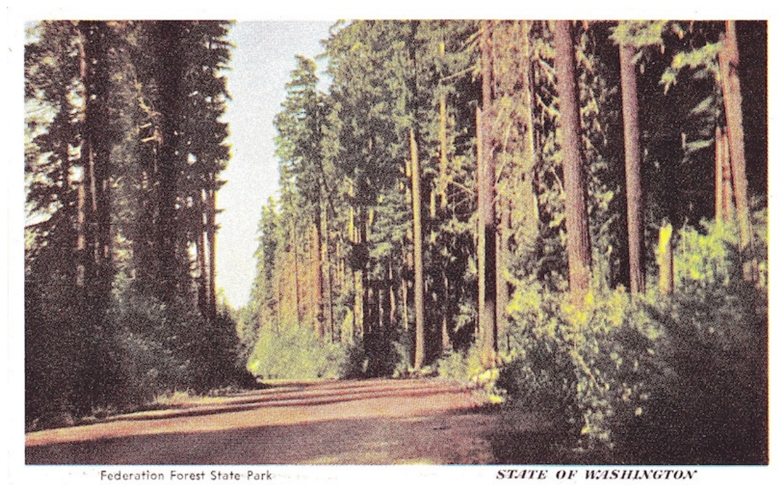
Federation Forest State Park, 1950's Postcard

To learn more, the "links" portion of our web site has a direct link to the Washington State Parks web site for Federation Forest. There you will find park information, an interactive map plus details on when the park is open.