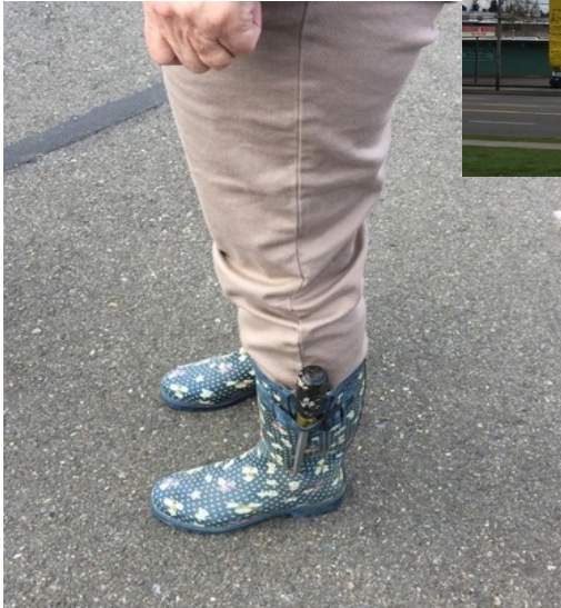
Dressed for duty!