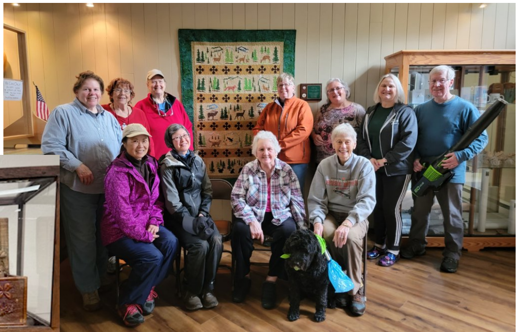
ABOVE: The gang's all here!