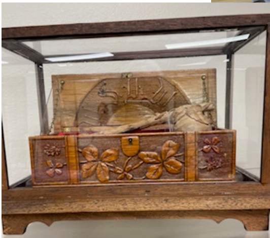
LEFT: The infamous Apple Gavel