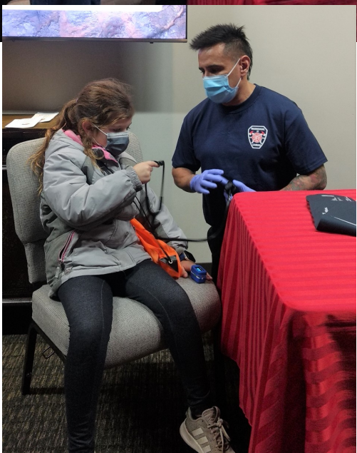
Photo left: Camas-Washougal Firefighter/Paramedic speaking with a young visitor. It is never too early to learn about heart health.