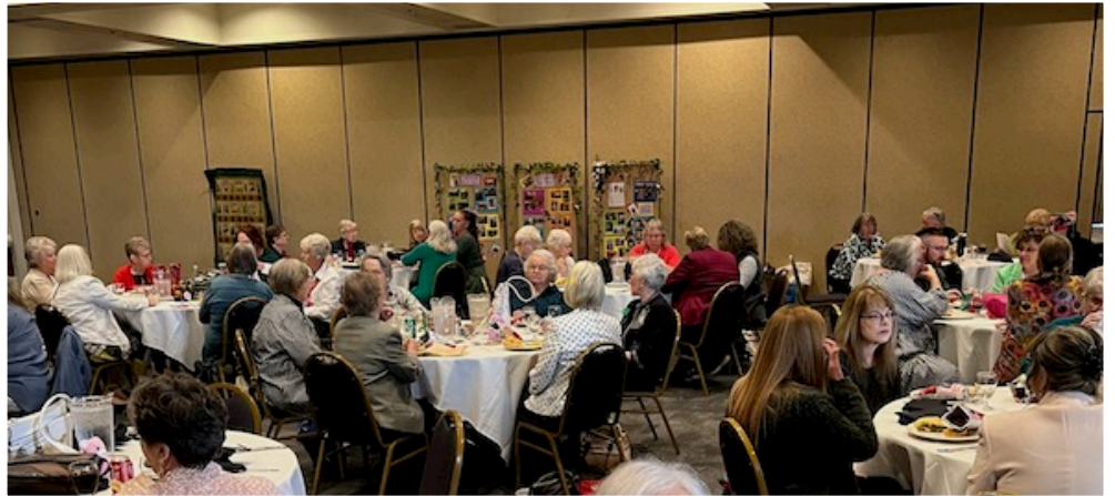
Friday Lunch Crowd!