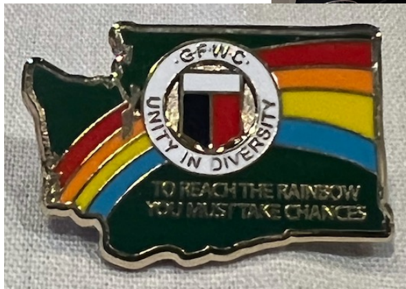
Pins from Lela for all members