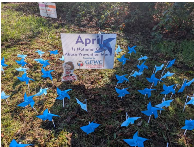
Mabel and club members planted pinwheels at the south entrance to Silverdale