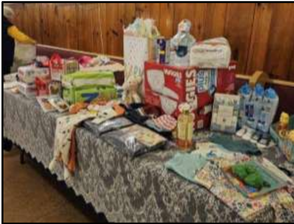
Baby Shower items collected for shelter