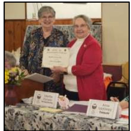
WCO awarded certificate