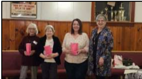
First Time Attendees honored with gifts