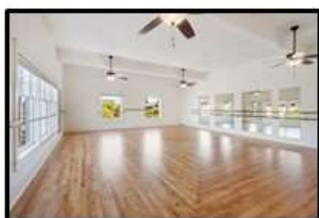
The Dance Studio