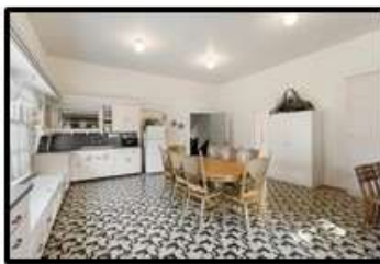
Upstairs 1940's Kitchen