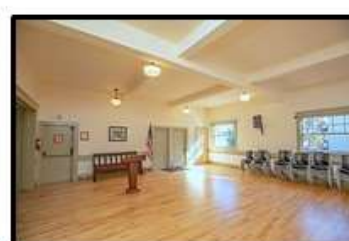
Main Meeting Room

PHONE: 360-753-9921 WEBSITE: THEABIGAILSTUARHOUSE.COM